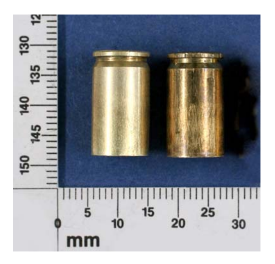
Fig. 2 The effect of lysis buffer on casings. Left a casing treated with lysis buffer. Right a casing that was untreated. Both casings came from the same batch

Obviously, it is crucial to focus on these category (4) matches, i.e., profiles matching to laboratory staff members. For this purpose, DNA profile elimination databases have been built by the Netherlands Forensic Institute and by the